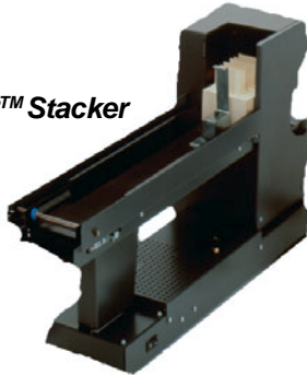
928 ™ Stacker