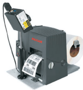
938 ™ Verifier with Monarch 9855 ™ Tabletop Printer