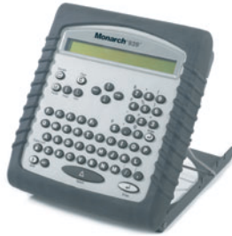
939 ™ Keyboard 939J ™ Keyboard

Enhance Your System's Productivity with Specially Designed Accessories