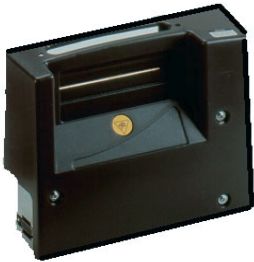
926 ™ Knife

Leading edge companion products that integrate seamlessly with your Monarch 9800 Series printers.