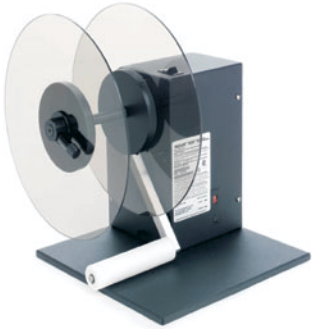
935 ™ Rewinder